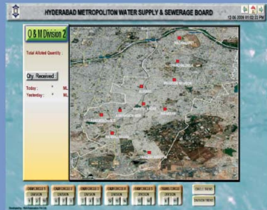
A Geographic Overview of a Division Within the Board's Service Territory